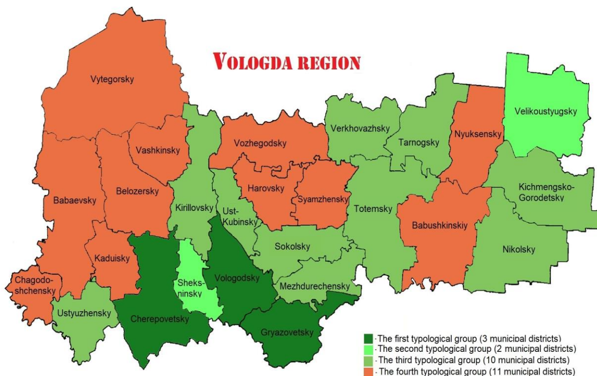
Fig. 7. / Рис. 7. Territorial differentiation of agricultural production in the Vologda region in 2020 / Территориальная дифференциация сельскохозяйственного производства в Вологодской области в 2020 году

Thus, the study has shown a deep territorial differentiation of the Vologda region's municipal districts by the level of agricultural production (figure 7). The districts of the first and second typological groups are located mainly in the south and south-west of the region's territory (except for Veliky Ustyug District, located in the second group) and are adjacent to major developed cities – Vologda, Cherepovets, Sheksna, Veliky Ustyug. The districts of the third typological group are located in the central and eastern part of the Oblast, the fourth in the west, the north and two districts (Babushkinsky and Nyksensky) in the east.