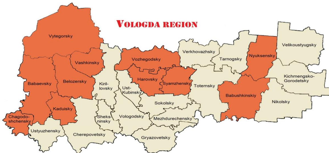
Fig. 6. / Рис. 6. The fourth typological group of municipal districts by the level of agricultural production in the Vologda region and its individual characteristics / Четвертая типологическая группа муниципальных районов по уровню сельскохозяйственного производства в Вологодской области и ее индивидуальным характеристикам

The fourth typological group includes eleven municipal districts of the region: Babayevsky District, Babushkinsky District, Belozersky District, Vazhegodsky District, Vytegorsky District, Kaduisky District, Nyuksensky District, Syamzhensky District, Kharovsky District and Chagodoshchensky District (figure 6). In the districts of this group agriculture has a rather «low» level of development. The volume of agricultural production (including livestock and crop production) is much lower than that of the first and second groups. In some districts, agricultural production is currently in decline.