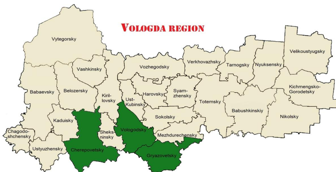
Fig. 3. / Рис. 3. The first typological group of municipal districts according to the level of agricultural production in the Vologda region and its individual characteristics / Первая типологическая группа муниципальных районов по уровню сельскохозяйственного производства в Вологодской области и ее индивидуальным особенностям

The first typological group is represented by the «leaders» districts – Vologodsky, Gryazovetsky and Cherepovetsky. They differ significantly from the rest by the level of agricultural production; they have the highest aggregate value by almost all indicators and are characterized by the availability of the largest resources for production (e.g., sown area and arable land (54,8 thousand ha and 57,2 thousand ha respectively), the number of cattle and cows, the number of rural population, energy equipment, energy availability, equipment, etc.), high production indicators in the branches of animal husbandry and crop production, as well as a strong financial and economic position (figure 3).