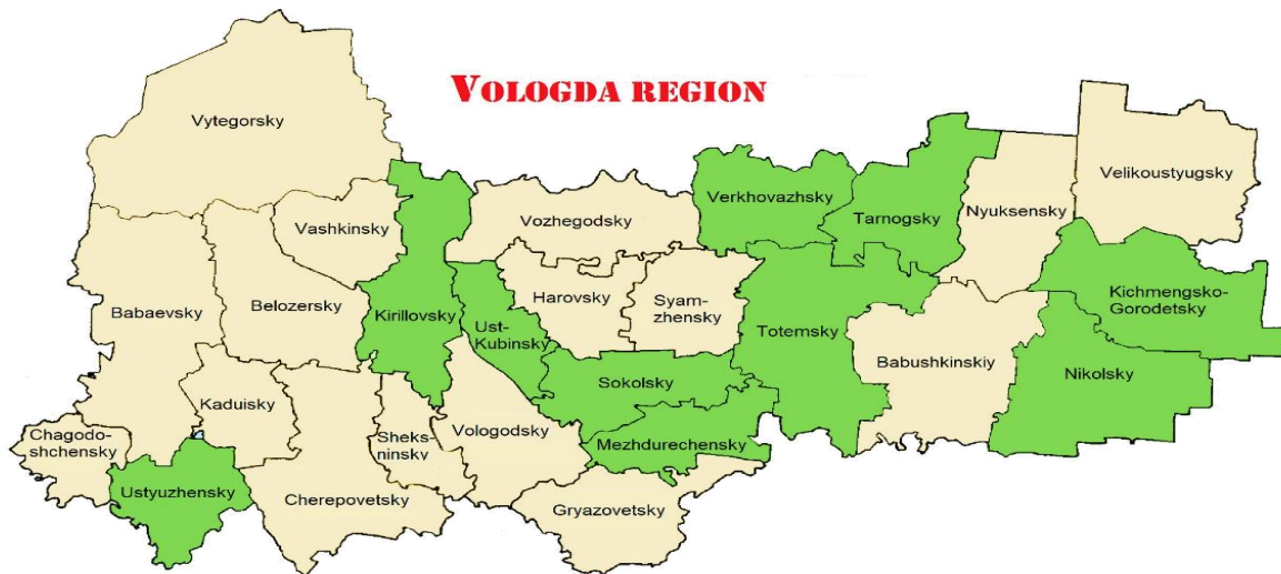
Fig. 5. / Рис. 5. The third typological group of municipal districts according to the level of agricultural production in the Vologda region and its individual characteristics / Третья типологическая группа муниципальных районов по уровню сельскохозяйственного производства в Вологодской области и ее индивидуальным особенностям

The fourth typological group includes eleven municipal districts of the region: Babayevsky District, Babushkinsky District, Belozersky District, Vazhegodsky District, Vytegorsky District, Kaduisky District, Nyuksensky District, Syamzhensky District, Kharovsky District and Chagodoshchensky District (figure 6). In the districts of this group agriculture has a rather «low» level of development. The volume of agricultural production (including livestock and crop production) is much lower than that of the first and second groups. In some districts, agricultural production is currently in decline.