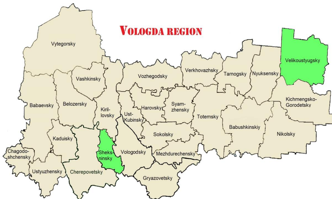
Fig. 4. / Рис. 4. The second typological group of municipal districts according to the level of agricultural production in the Vologda region and its individual characteristics / Вторая типологическая группа муниципальных районов по уровню сельскохозяйственного производства в Вологодской области и ее индивидуальным особенностям

The second typological group included Velikoustyugsky and Sheksninsky districts (figure 4). This group lags a little behind the first group of «leaders» in terms of the values of indicators, but also has quite high production, economic and financial results. For example, the number of cows amounted to 10825 head in 2020 (2,2 times more than in the third group and almost three times lower than in the first group), and the values of indicators on gross milk yield, volume of grain production, areas of grain and forage land are much higher than in the third and fourth groups. This group has the best indicators of labour productivity (27971,3 rubles), capital productivity (2,4 rubles) and production of cattle meat per 100 hectares of farmland (228,7 quintals) among all the districts. This group is characterized by an «above average» level of agricultural development. These districts can further join the first group or serve as «points of growth» of agricultural production in the region.